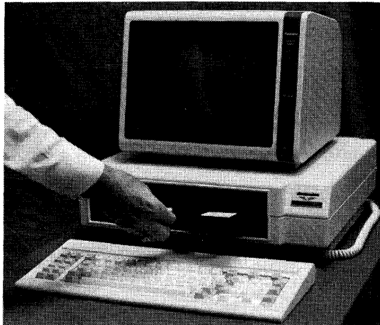
Inserting A Diskette Into The DIMENSION 68000