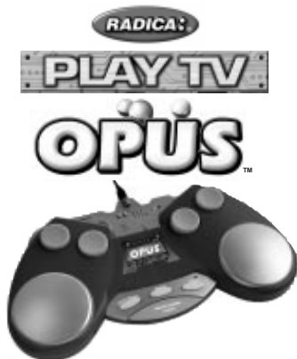
MODEL 8046 P/N 82350100 Rev.A For 1 or 2 players / Ages 8 and Up