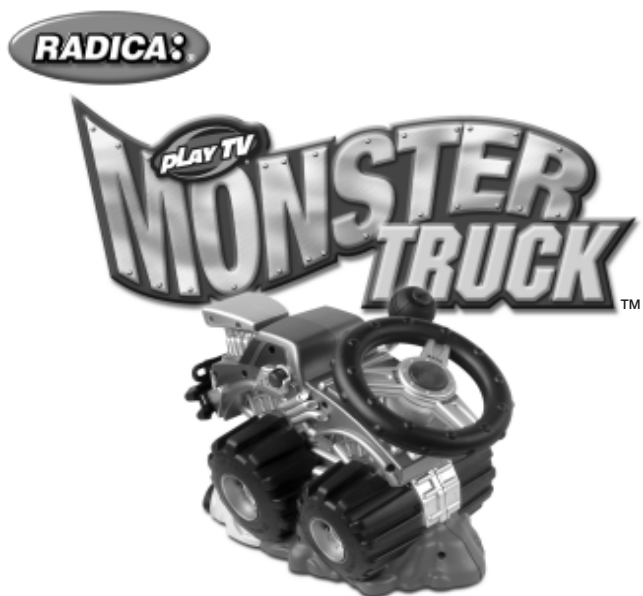
Model 74026 For 1 player / Ages 8 and up INSTRUCTION MANUAL P/N 82385500 Rev.A