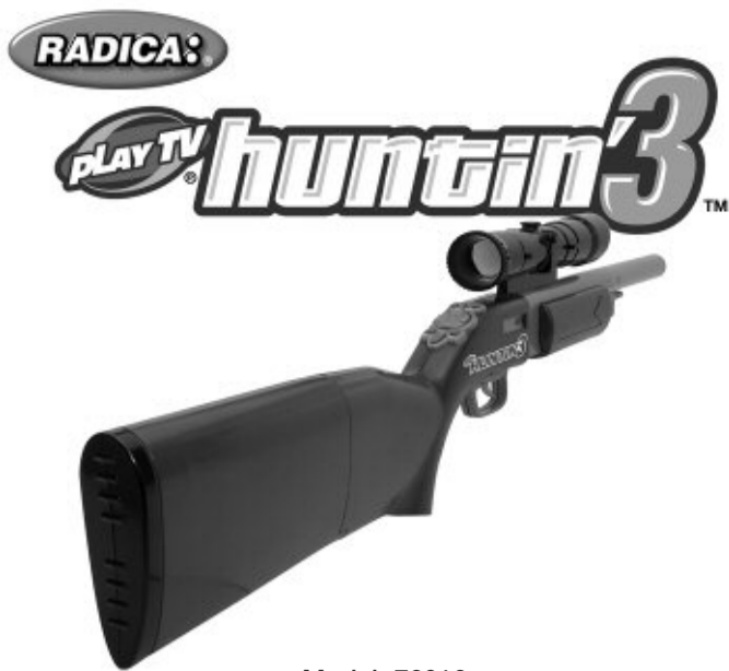
Model 76016 For 1 player / Ages 8 and up INSTRUCTION MANUAL P/N 823A1800 Rev.B